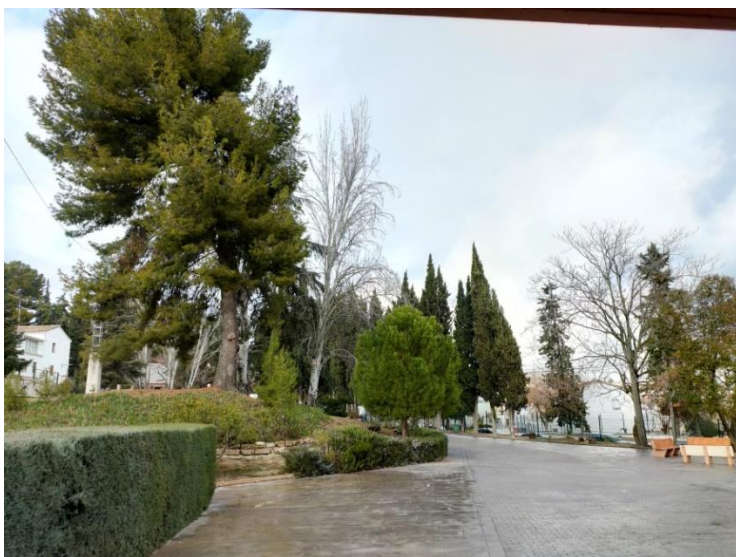
View from main entrance