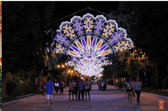
Feria (september.)