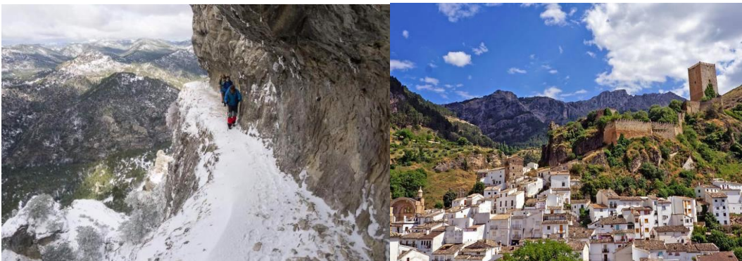
Winter at Sierra de Cazorla