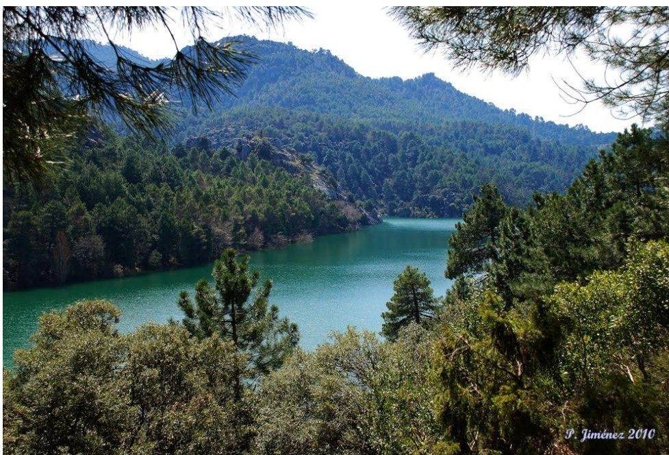
Aguascebas reservoir.