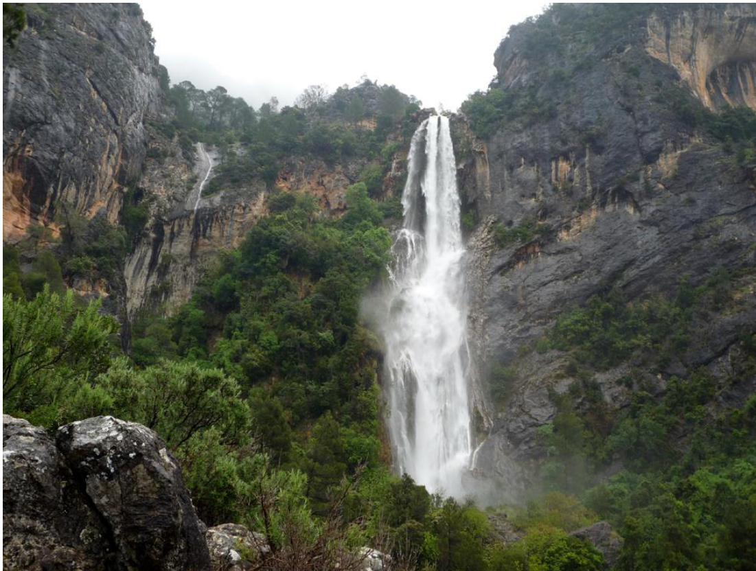
La Osera Waterfall (highest waterfall in Andalusia)