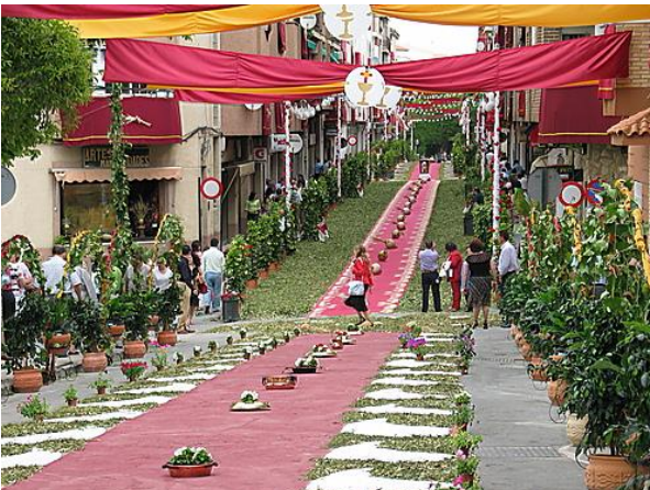
Corpus Christi (may/june)