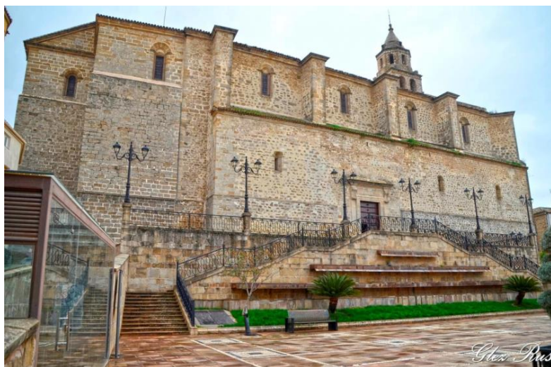
Main church.